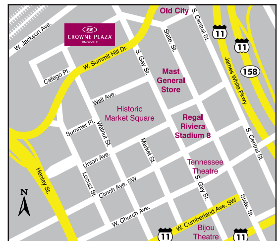
From I-40/75 take the James White Parkway exit #388A to Summit Hill Drive and turn right. The Crowne Plaza is three blocks on the right.