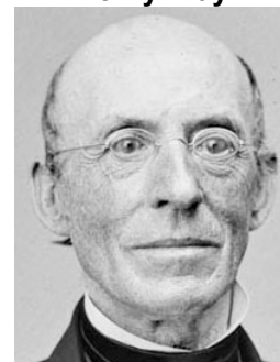
William Lloyd Garrison