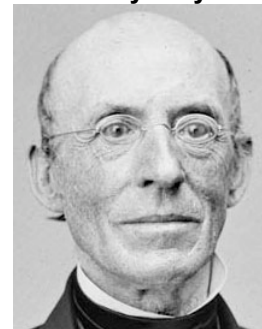
William Lloyd Garrison